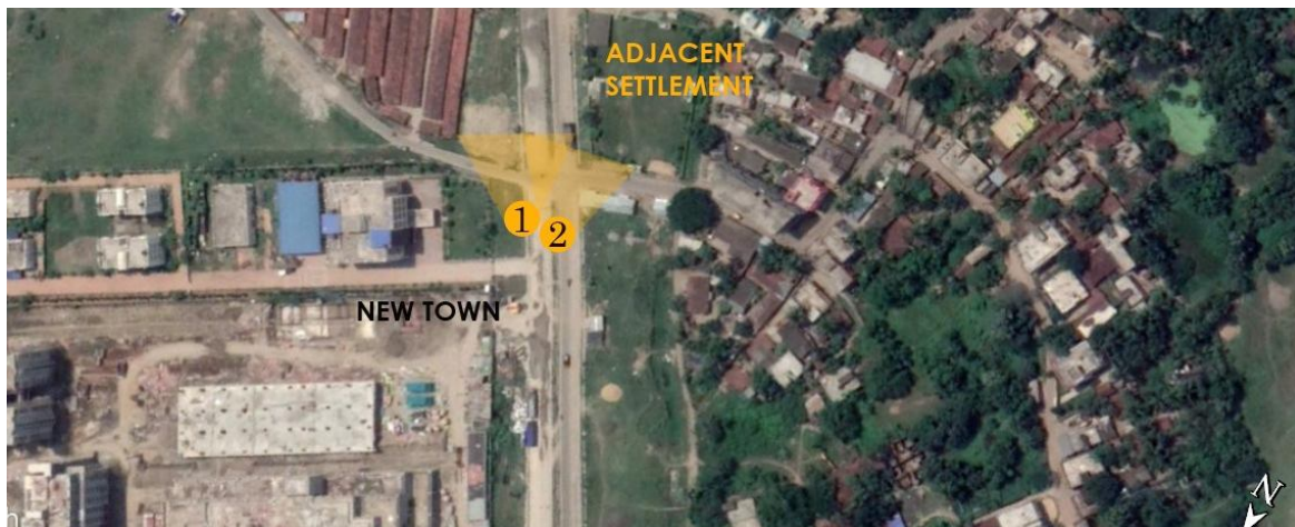
Figure 0-1: Key map for site pictures