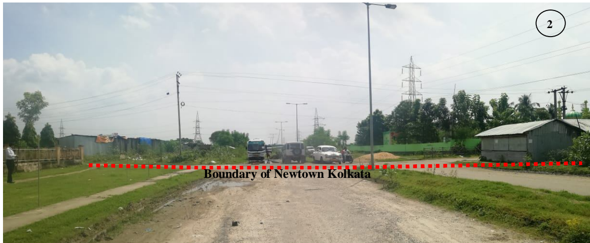
Figure 0-3 Proposed project site showing the existing carriage way

The project of temporary fencing and cattle grid has been conceived from Narcotic Control Bureau Building plot line to the peripheral canal. The length of the fence will be 38.2 meter among which 10.2 meters stretch is from NCB building plot line to the carriageway and the 28 meters stretch is from carriage way to canal edge. Both the lengths of the fencing will be on ROW to be developed in future hence the fencing will have to be temporary.